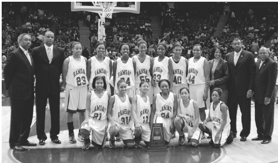
The Ramsay Lady Rams won their fourth straight Class 5A State Girls Basketball Championship