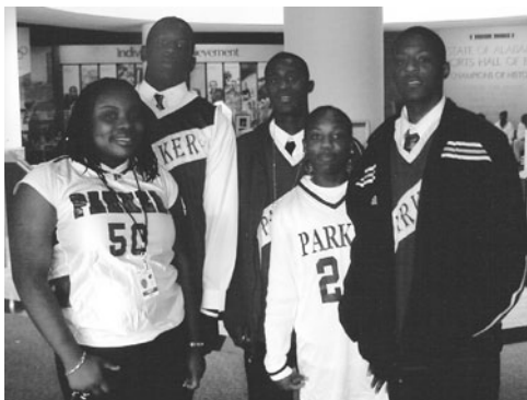
Members of the Parker High School basketball program were on hand at this year's BAP Media Day.